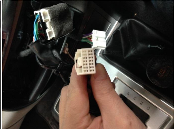
14 PIN Connector