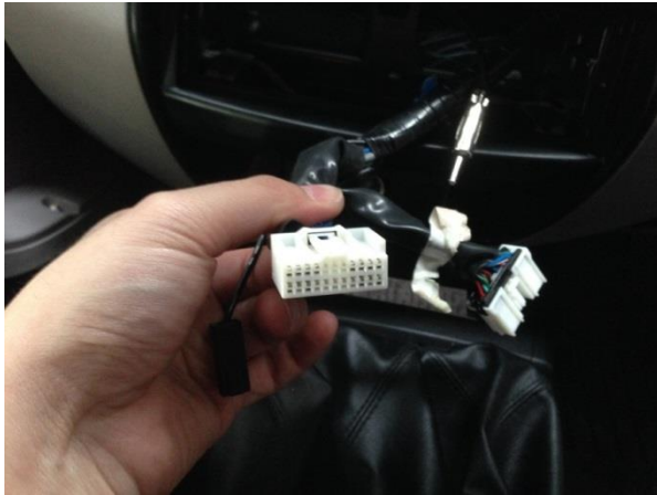
22 PIN Connector

Steering Wheel Control Wires can be found on one of the radio harnesses as shown below (either a 22 PIN connector or a 14 PIN connector depending on the year of your Triton GLX-R):