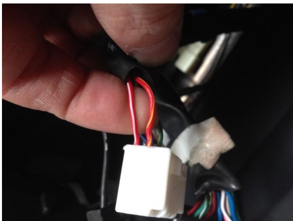
22 PIN Version

*The same colour configuration for both different versions of Triton GLX-R looms