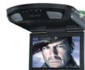
Dual Zone Ready***