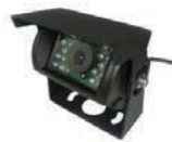
Dual Camera Ready**