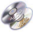
DVD / CD player