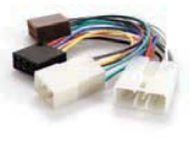
Plug n play wiring

*iPOD not included **Requires VMS Dual Camera Switch unit **Rear seat display is not included