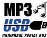
USB support MP3 player